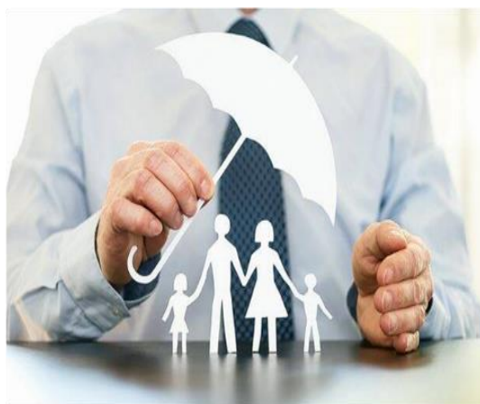
Life Insurance (LIC)