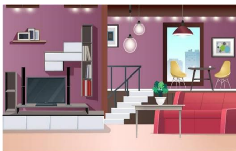
-:Interior Designing:- Design Your Home in way you need