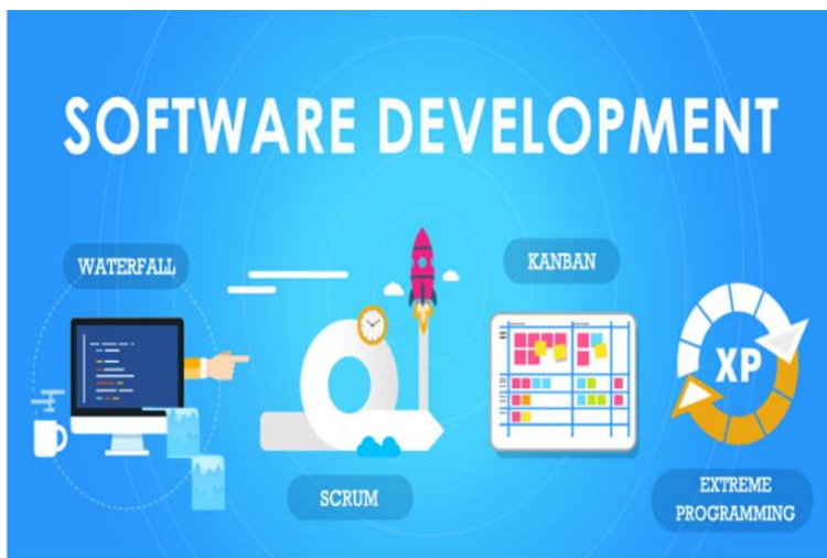
-:Software Development:- Website and Application Development