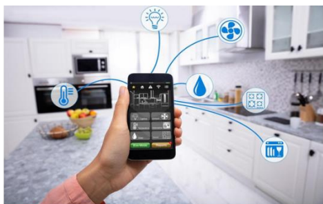
-:Home Automation:- Let Switch the Home into Smart