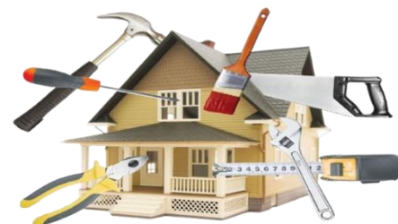
-:Home Repairs:- Solve your Home Repairs