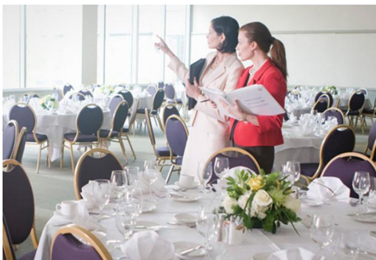
-:Event Planning:- We are here to Plan your Event