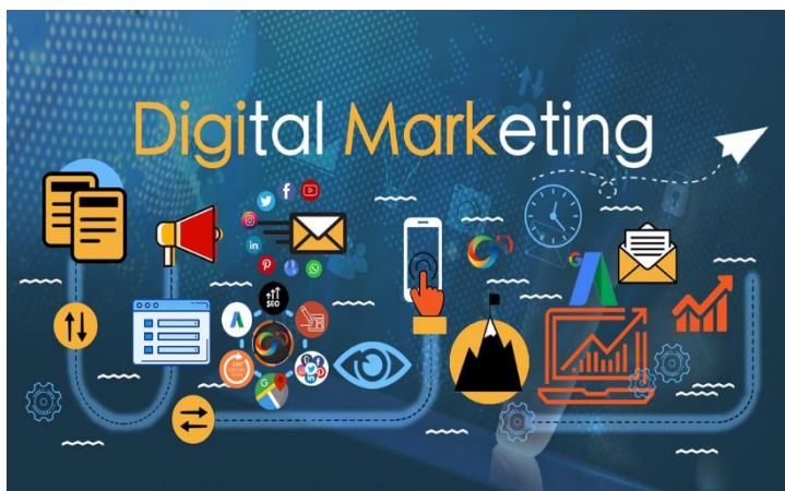
-:Advertise you're Product:- Reach around the World by using Our Service